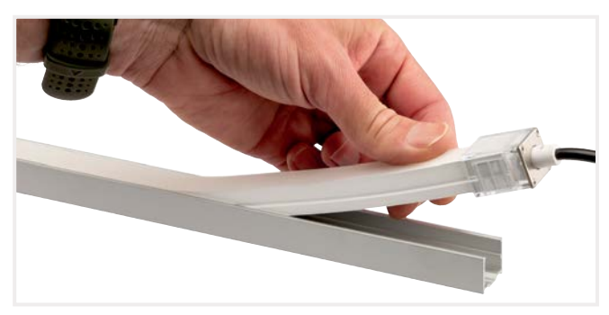
Channel mount option