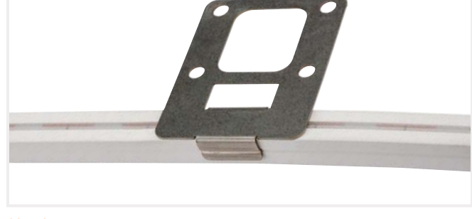
Hardscape mount option

Website fxl.com | Customer Support +1-760-744-5240 | Technical Service +1-760-591-7383