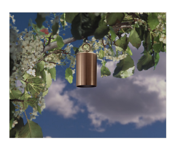
The Ease of Light Small scale plants can become the focal point with the VL's micro moonlighting effect. Over time, the copper will produce a unique patina, allowing it to blend into the landscaping.