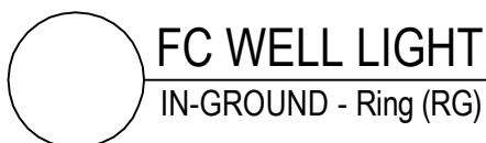
FC WELL LIGHT IN-GROUND - Ring (RG)